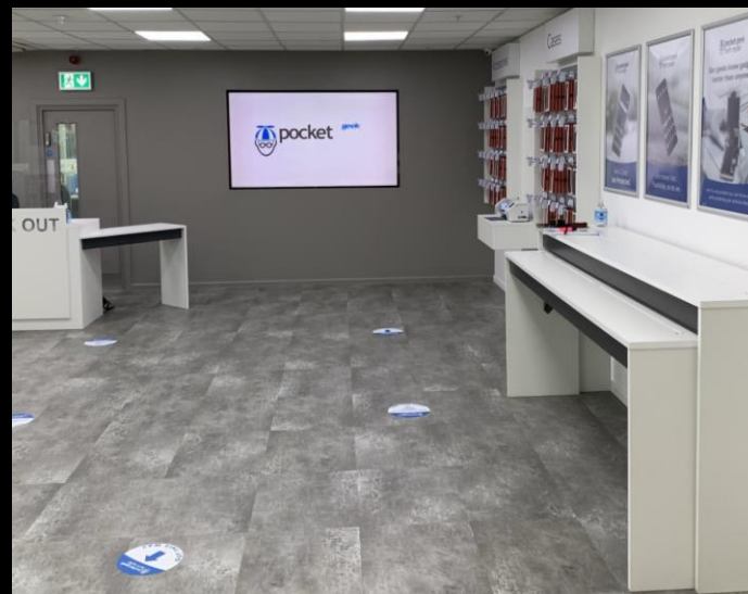
Check out desks and nesting tables