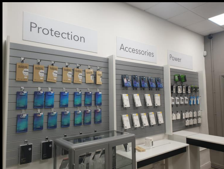
Accessory slat wall and display tables.